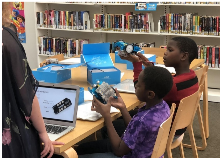
Teens Engineer BHM, to be held at Inglenook Library September 19, is a partnership with UAB School of Engineering