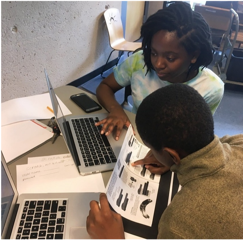
Teens at Five Points West Library learn to code at mini-camp