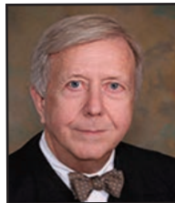
The Honorable Judge Scott Vowell